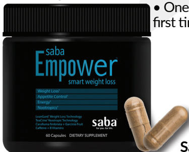
SabaEmpower™ Smart Pills